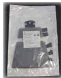
Sterile, Double Peel Pack

* ILLUSTRATION ONLY -HOOK(S) NOT INCLUDED